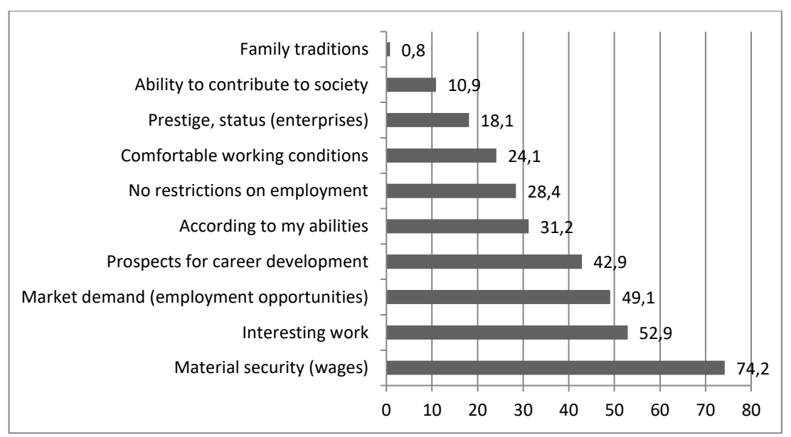
Fig. 2: Directions to which students are guided when choosing a place of work (% of respondents)

organizations which got to research objects, this information is absent completely. Only on two websites there is this information and that in a generalized view. Information is equally significant for about 1/3 respondents about activities by profession, about specific conditions of work, about the development strategy of the entity. If to compare to representation of this information on the websites, then the development strategy is reflected practically in all sources, and here about activities by profession only in every second website, and that by the most mass professions. Therefore such information shall be added in other carriers of brand. Researchers note (Mansurov (2011), Osovickaya, (2016,) that the value proposition as a basic element of HR brand, shall reflect values of potential workers. Therefore at the following stage values of students in case of the choice of a place of employment were studied. It was offered to respondents to range employment values on 10 attributes (see Fig. 2).