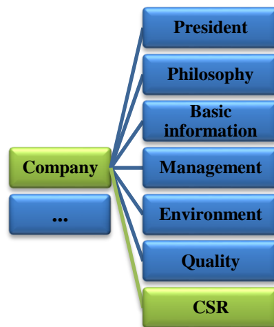
Fig. 1: Information about CSR on websites of HMMC