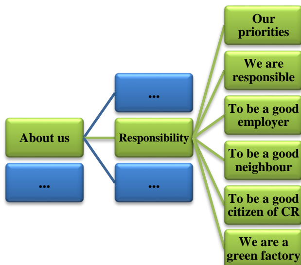
Fig. 3: Information about CSR on websites of TPCA

On TPCA's websites the bookmark Responsibility focuses on CSR. There the company communicates its priorities, its mission, its principles and its values, and it also declares its goal to be a good employer, good neighbour and good citizen and it also declares there its responsibility for the environment (section We are a green factory) – see Figure 3.